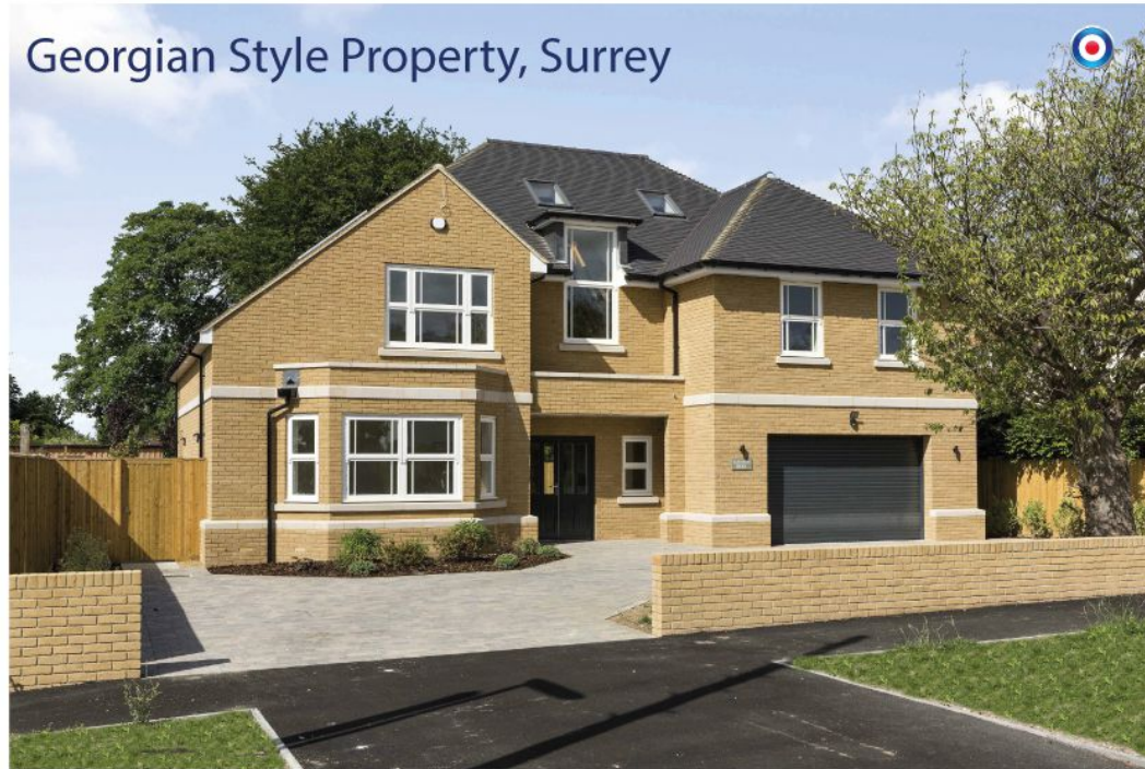
Georgian Style Property, Surrey